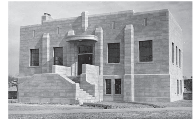
Above: The Hamline Park Building.

On October 10, over 20 neighborhood residents had a very thoughtful and spirited discussion about the future of the Hamline Park Building. Most attendees voiced strong support for finding a new use for the building, now that HMC has moved to the library.